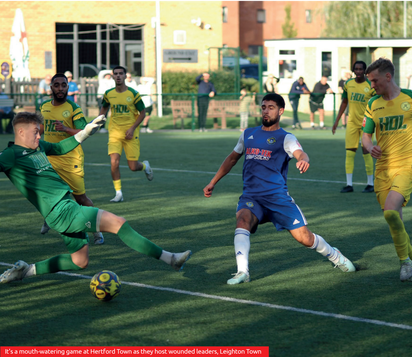
It's a mouth-watering game at Hertford Town as they host wounded leaders, Leighton Town

They are in upbeat mood having secured a fantastic 3-0 victory over third-place Barton Rovers last weekend and now they have Hitchin Town in their sights as they look to build on what they have done so far this term with seven wins from their 20 League games. It promises to be a fascinating battle between two sides full of belief.