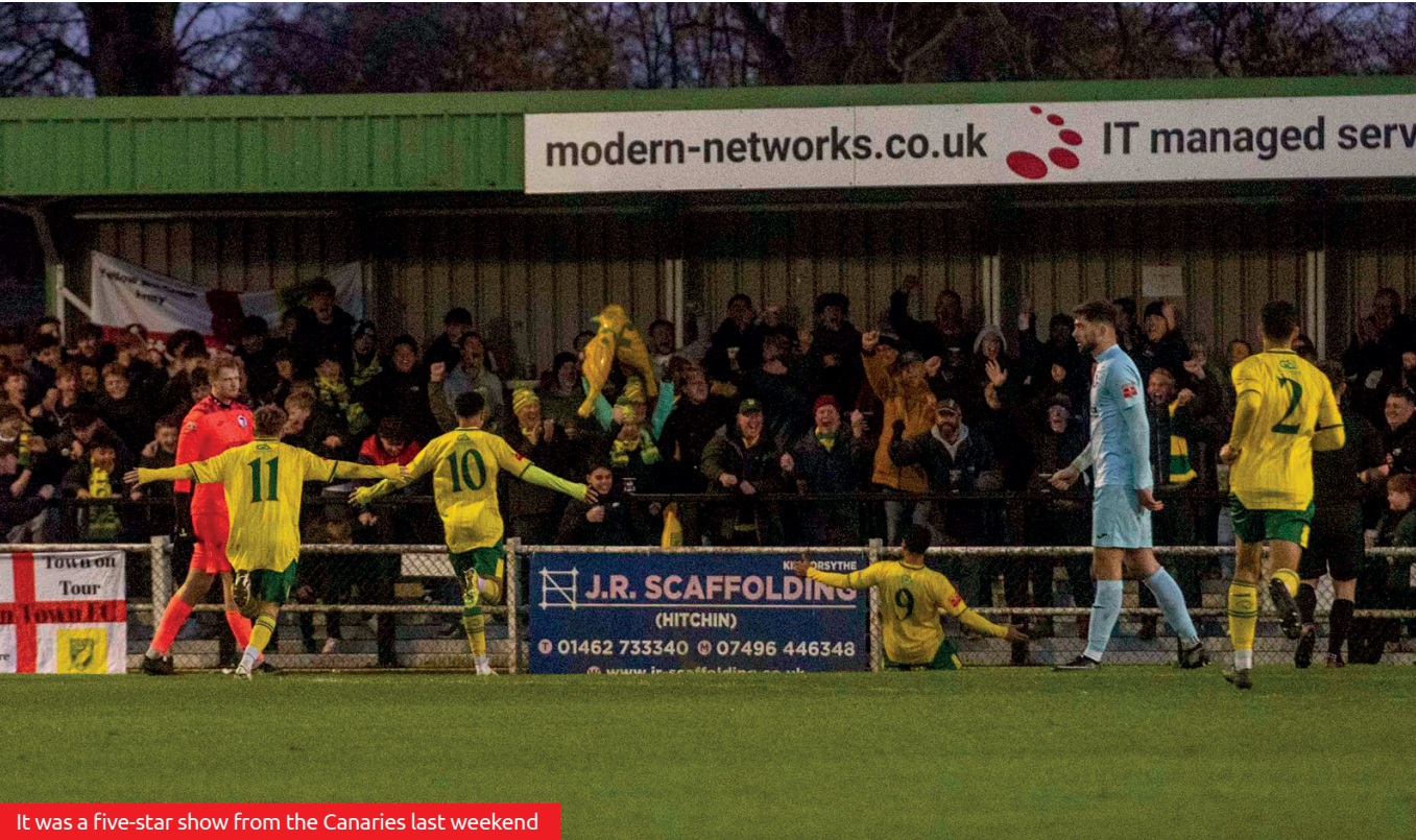
It was a five-star show from the Canaries last weekend

"I think as a group, anything less is a failure. But our season is defined now because we beat Leighton Town 5-0; we must have the same mentality for when we face teams towards the bottom