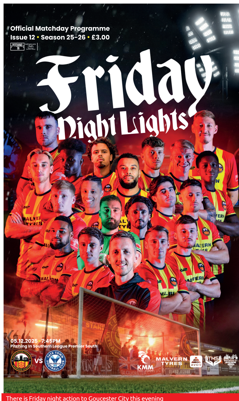
There is Friday night action to Gloucester City this evening

Gloucester City go into the game in second place in the table. They came from two goals down to draw 2-2 at Wimborne Town last weekend as they look to keep on the coat-tails of leaders, Walton & Hersham.