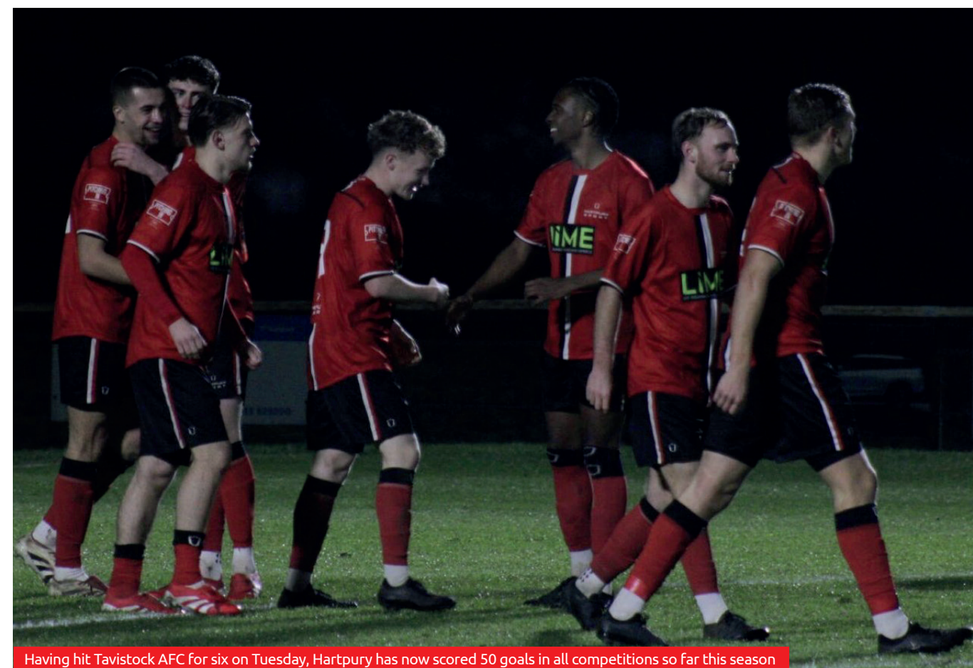
Having hit Tavistock AFC for six on Tuesday, Hartpury has now scored 50 goals in all competitions so far this season

Hot on the heels of leaders, Portishead Town, are the winners of the PST Sport Club of the Month award for November 2025, Frome Town. They sit just one point below them as they welcome Sporting Club Inkberrow at the weekend. Their opponents were two levels below them last season, but have enjoyed an exciting journey that is showing no signs of coming to an end any time soon.